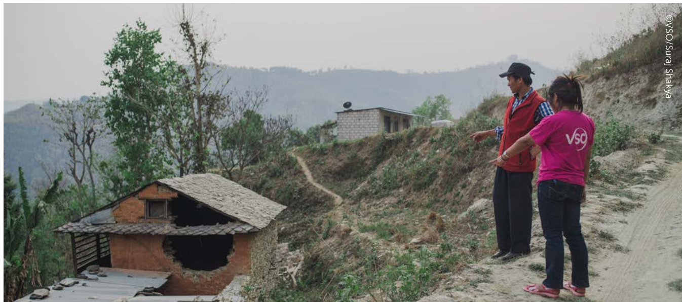
Assessing the damage following the 2015 Nepal earthquake.

"Just three weeks ago we practised a flood simulation, which was very effective – in this recent flood we were able to rescue more than 60 people."