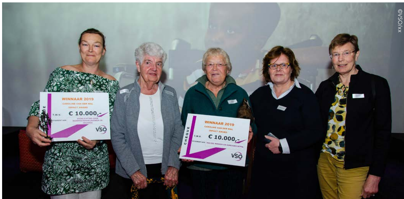
At the Heart of VSO event, the projects 'Cervical cancer education in Uganda' and 'Safe mother and childcare in Nepal' received the Caroline van der Wal Award.