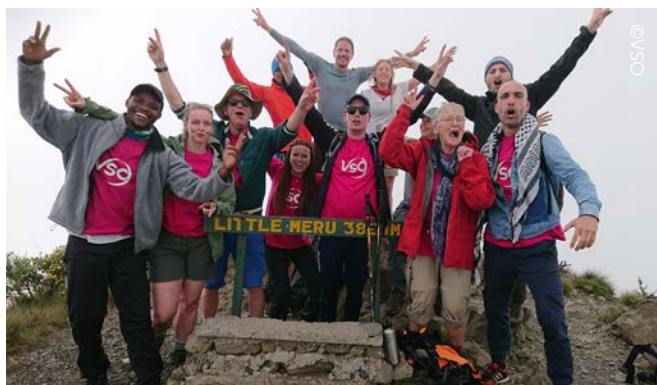
15 VSO supporters took on the challenge of climbing Mount Meru in Tanzania, raising funds for the project RISE (Raise Income for School Education).

One safeguarding incident involving a volunteer recruited by VSO Netherlands was reported in the last fiscal year. An International VSO Incident Management Team was immediately established, and the incident was reported to the relevant authorities as per protocol. The incident has in the meantime been fully investigated and resolved and an independent external evaluation is being carried out to review the incident management response for organisational learning.