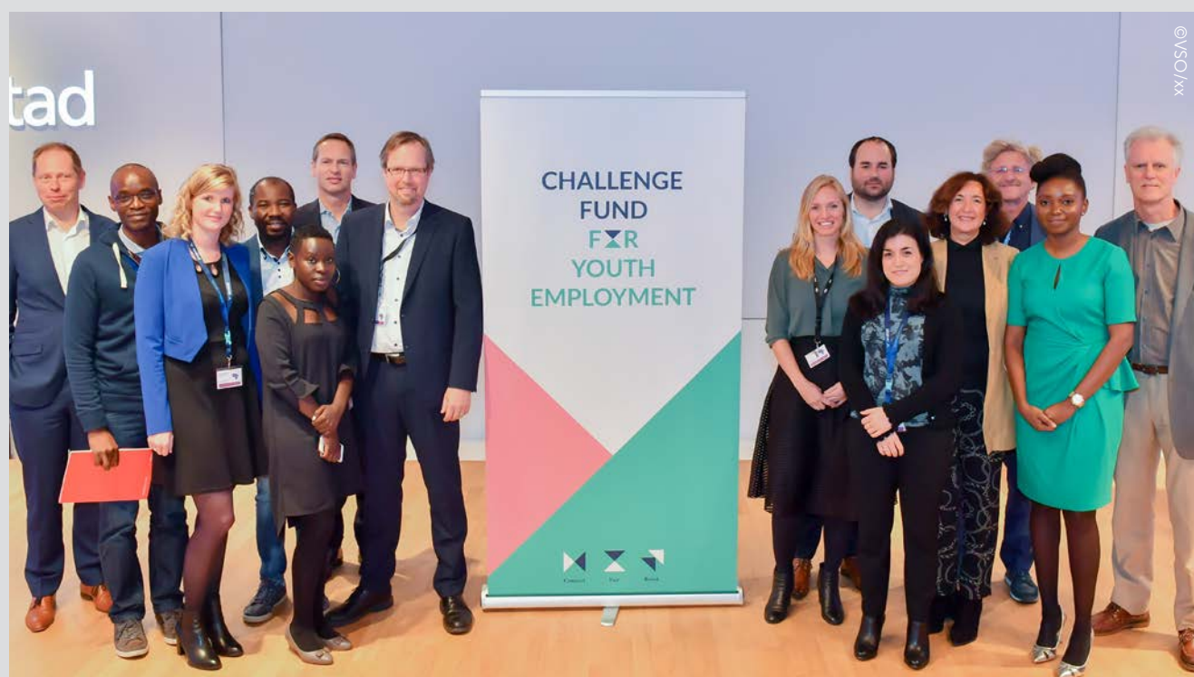
During the Partnership for Sustainable Youth Employment Seminar, the Challenge Fund for Youth Employment was launched.