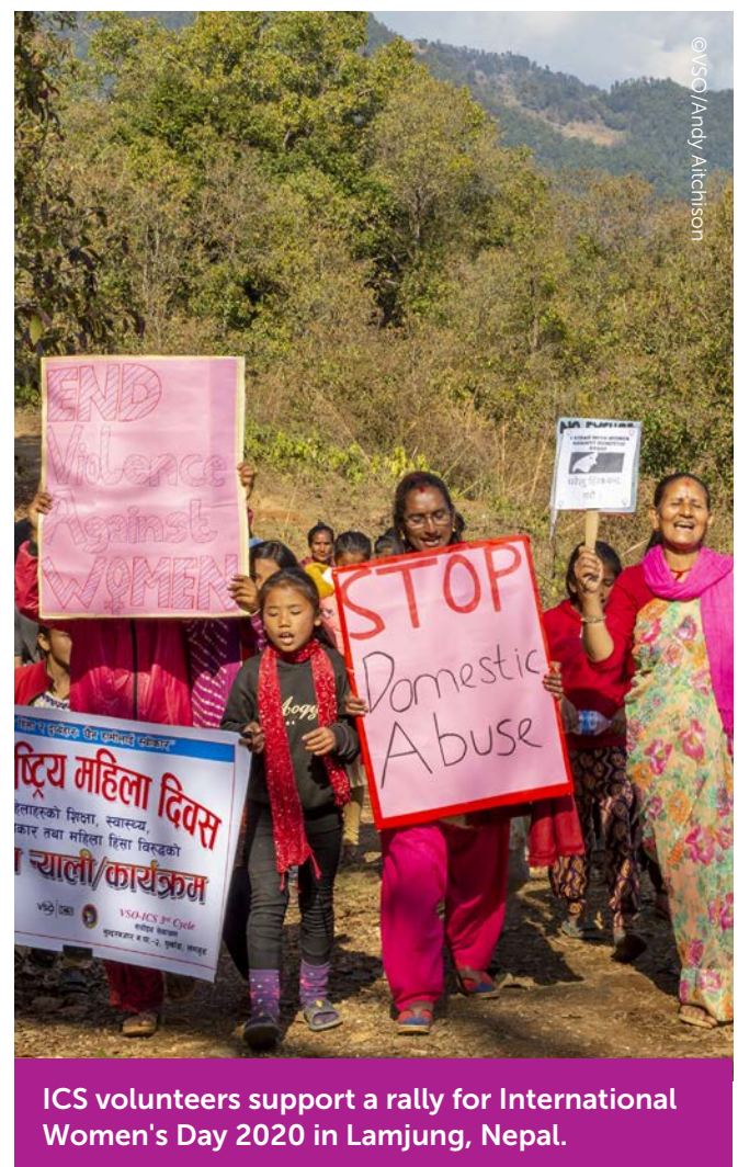
ICS volunteers support a rally for International Women's Day 2020 in Lamjung, Nepal.

Nepal is one example of policy change strengthening the impact we are able to make. Here we are coupling bridging classes, to help children with disabilities back into formal schooling, with changes to inclusive education guidelines.