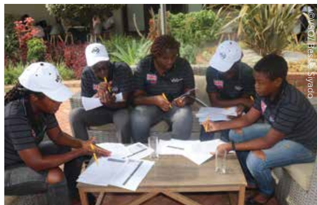
Young volunteers plan how to stop the spread of COVID-19 disinformation amongst communities in Zimbabwe

The team in Zimbabwe are part of a wider Youth Engagement Network established by VSO in Africa and Asia, that supports young people to volunteer in their communities. Many former International Citizen Service (ICS) volunteers – inspired by their experience – are involved. These youth-led networks exist in Zimbabwe, Bangladesh, Cambodia, India,