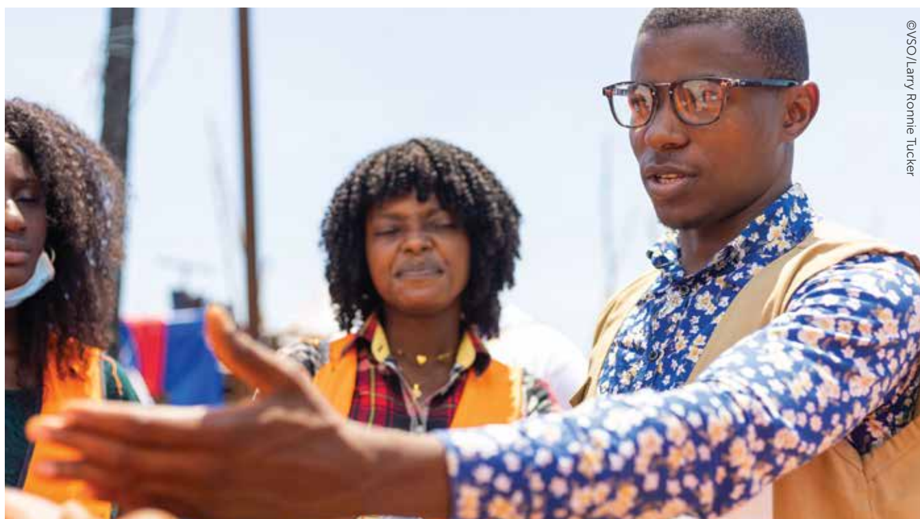
Volunteers mobilise to respond to fires in Sierra Leone

As well as supporting the communities we work with, the programme helped VSO better understand how to support those volunteering in these at-risk contexts. There are now disaster preparedness plans for 15 countries, which will help us better support emergency responses to disaster in those places. In the past year alone, these plans and response systems have supported VSO to respond to multiple conflict, climate and COVID-19 emergencies.