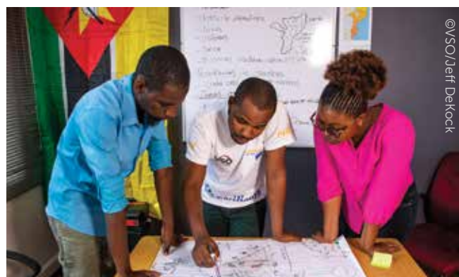
Volunteers respond to Cyclone Idai, Mozambique

Communities put in place early warning systems, community notice boards, undertaken emergency simulations, and created support plans. Early