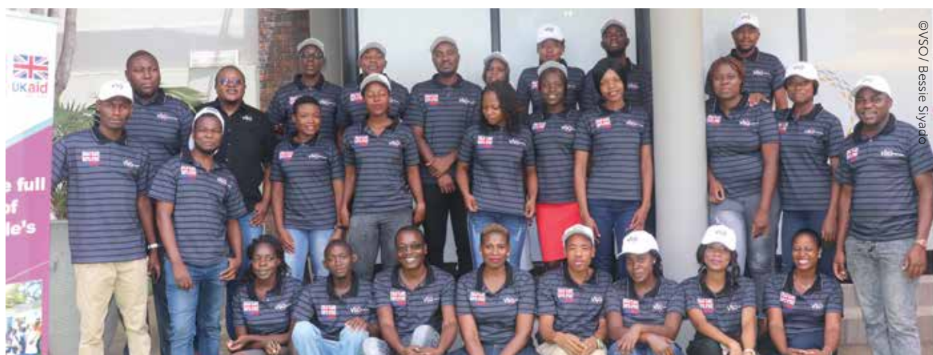
The Zimbabwean Youth Engagement Action Team (YEAT)

Whilst the UK government decides its future international youth volunteering approach, these networks demonstrate the power of young people to create and deliver change. VSO continues to support these networks, seeing the vital difference they make in communities they are uniquely placed to serve.