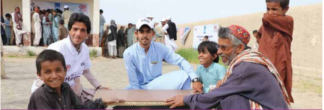
Communities prepare for provincial disaster response in Pakistan