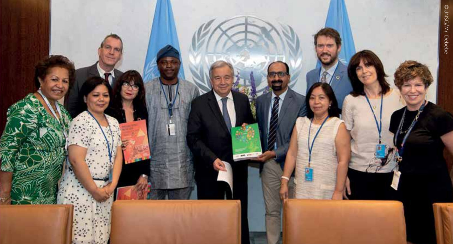
Representatives from VSO presenting our Citizens Voices report to UN Secretary-General Antonio Guterres